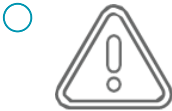
25. Define a vulnerability analysis and resolution strategy