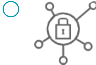
08. Identify digital assets