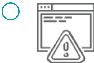
27. Incident response policy