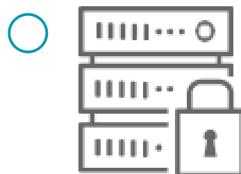
17. Endpoint Detection and Response (EDR)