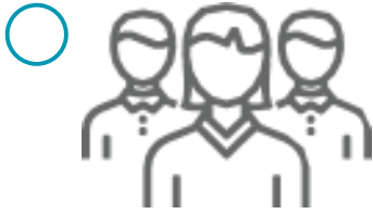
04. Security awareness training of employees and contractors