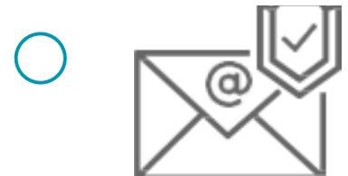
12. Secure Email Gateway (SEG)