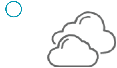
24. Monitor and track behavior of cloud apps