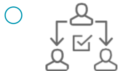
29. Incident response roles and responsibilities