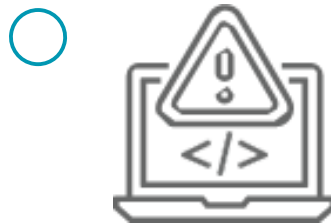
26. Vulnerability management program