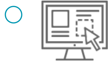
06. Clean desk policy