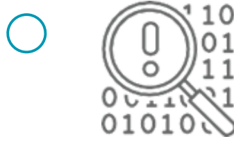
05. Phishing awareness training