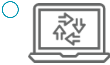
19. Clean up all unused programs on all systems