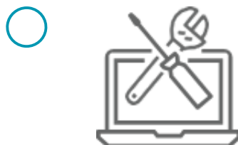
28. Incident response procedure