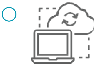
14. Configure Backup Solutions