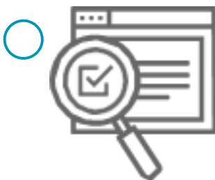
13. System Auditing