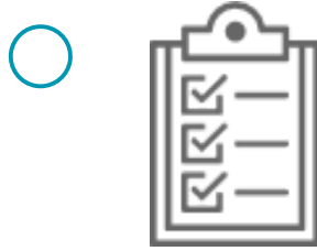
20. Use group policies and active directory