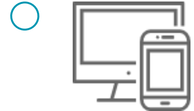
09. Multi-Factor Authentication(MFA)