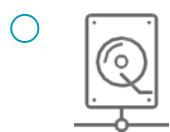
15. Test Backup Solution