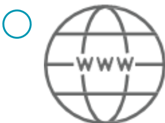
16. Domain Name System (DNS) and content filtering