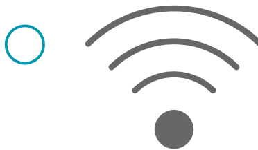
11. Secure Wi-Fi/wireless networking