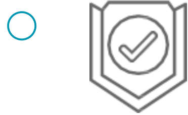
21. Secure Endpoint configurations